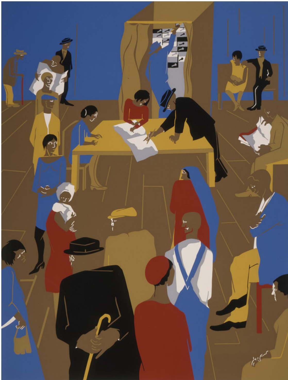
JACOB LAWRENCE. THE 1920'S...THE MIGRANTS ARRIVE AND CAST THEIR BALLOTS. 1974

This pamphlet was accessed from the Boggs Center's website .