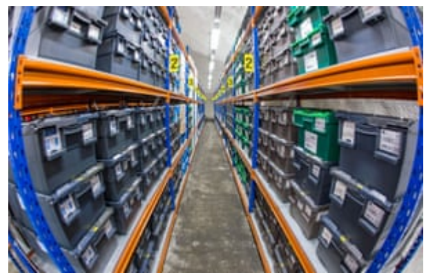
Plastic boxes containing plant seeds inside the international Svalbard Global Seed Vault on Spitsbergen, Norway.

But the breach has questioned the ability of the vault to survive as a lifeline for humanity if catastrophe strikes. "It was supposed to [operate] without the help of humans, but now we are watching the seed vault 24 hours a day," Aschim said. "We must see what we can do to minimise all the risks and make sure the seed bank can take care of itself."