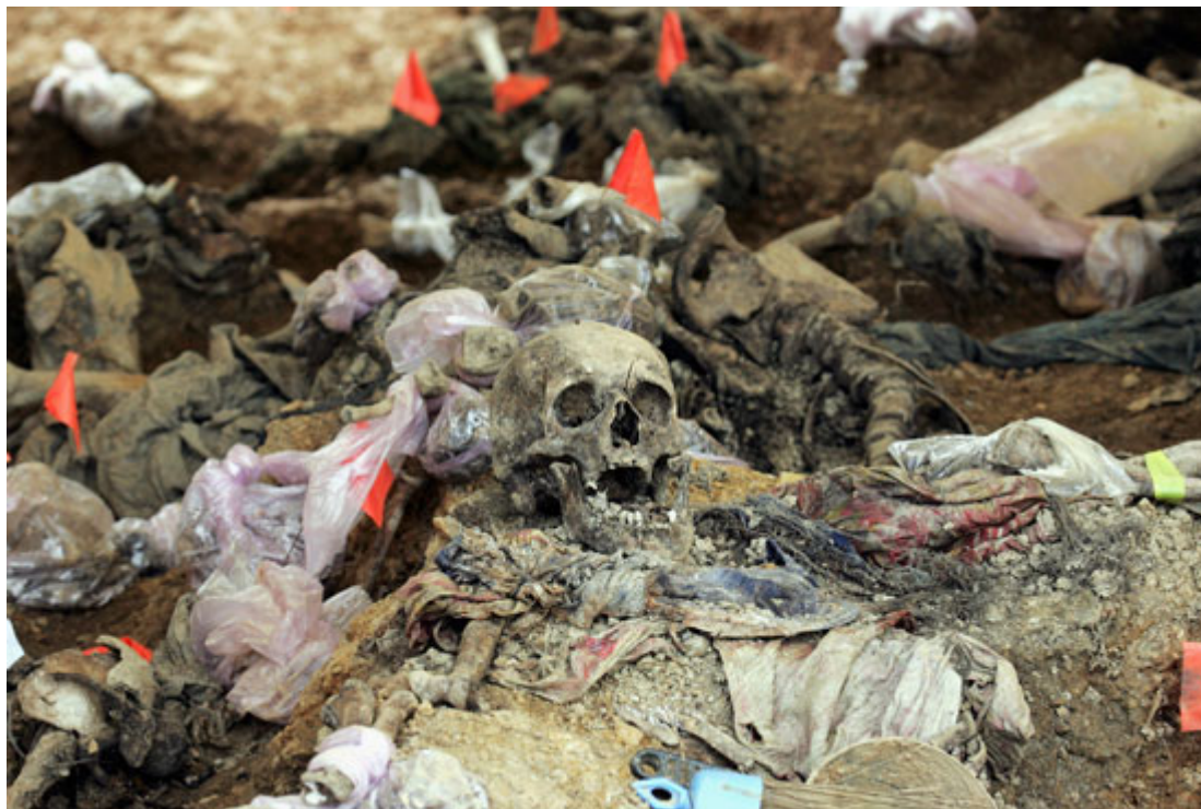
Forensics experts work on exhuming and identifying Srebrenica victims, Bosnia and Herzegovina, July, 2005.