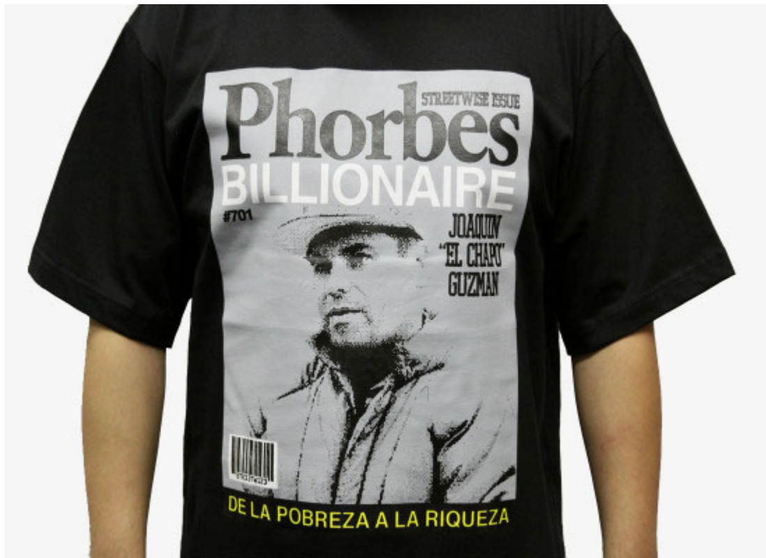
Between 2009 and 2011, Forbes ranked "El Chapo," head of the Sinaloa drug cartel, the second most powerful man in Mexico, and respectively the 41st, 60th, and 55th most powerful man in the world.

The narco business is a pillar of the Mexican economy, and in fact the head of the Sinaloa Cartel, Joaquín "El Chapo" Guzmán, was listed by Fortune magazine as one of the most prominent businessmen of 2012. Why not? After all, he is just a neoliberal entrepreneur who deals in deregulated kidnappings, drug trafficking, and murder.