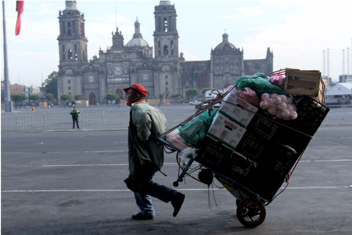
ESCENA COTIDIANA EN EL ZÓCALO CAPITALINO.

El sistema de dominación y acumulación en que vivimos -conocido como capitalismo- tiene como atractor principal: la acumulación de poder y riquezas. En su comportamiento actual, para lograr sus fines el sistema emplea todos los modos de producción que lo precedieron. Combina el trabajo asalariado con el esclavismo, y uno y otro con el trabajo del siervo y con las nuevas formas de tributación y despojo, que hoy se ocultan en deudas impagables y créditos usureros, que los acreedores cobran con bienes y territorios por las buenas o por la fuerza.