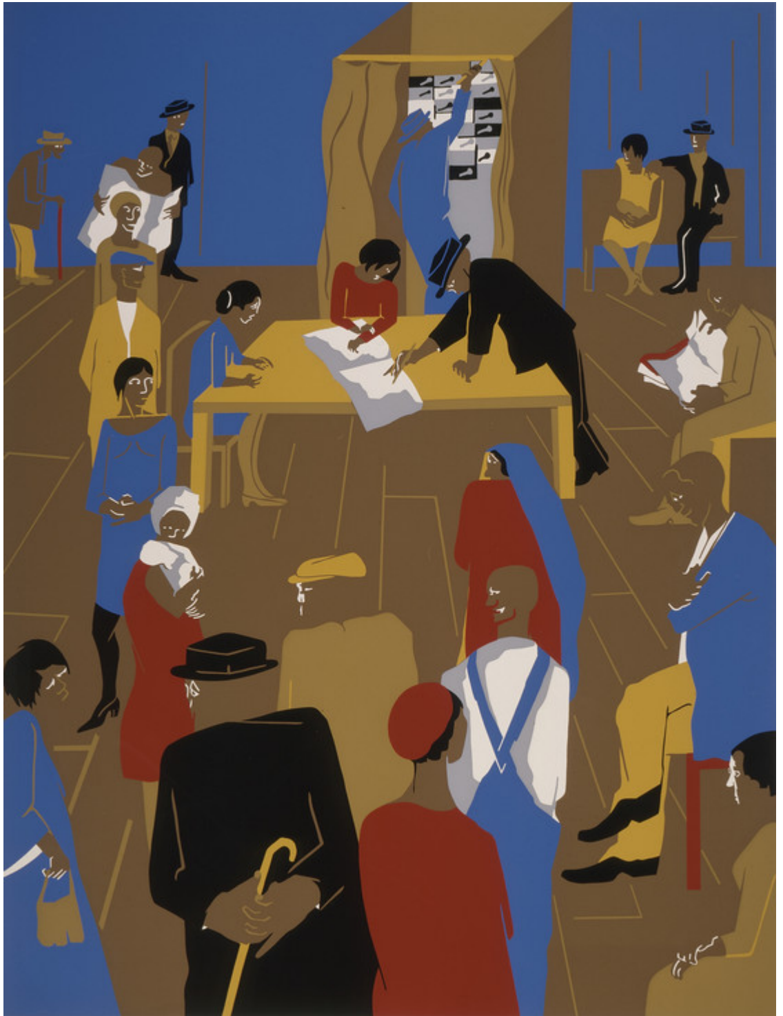
JACOB LAWRENCE. THE 1920'S...THE MIGRANTS ARRIVE AND CAST THEIR BALLOTS. 1974

This pamphlet was accessed from the Boggs Center's website .