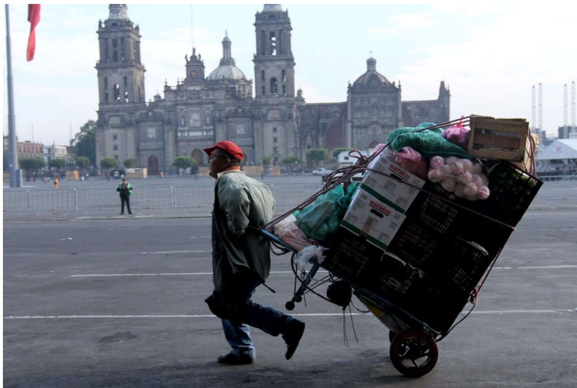
ESCENA COTIDIANA EN EL ZÓCALO CAPITALINO.

El sistema de dominación y acumulación en que vivimos -conocido como capitalismo- tiene como atractor principal: la acumulación de poder y riquezas. En su comportamiento actual, para lograr sus fines el sistema emplea todos los modos de producción que lo precedieron. Combina el trabajo asalariado con el esclavismo, y uno y otro con el trabajo del siervo y con las nuevas formas de tributación y despojo, que hoy se ocultan en deudas impagables y réditos usureros, que los acreedores cobran con bienes y territorios por las buenas o por la fuerza.