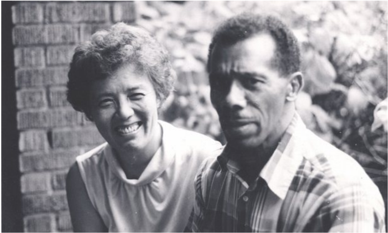
GRACE LEE BOGGS AND JAMES BOGGS, IN AN UNDATED PHOTO.

“That is why the main question before us is “How can we become new men and new women?” willing to accept the challenge to live by the vision of another culture, a new culture we still have to create, a culture based on social responsibility and respect for one another instead of individualism and materialism and on a love for and kinship with the land and with Nature, instead of viewing Nature as something to be conquered and land as a commodity to be owned? How do we create a culture that is life affirming rather than life destroying, which is based on caring and compassion rather than on the philosophy of the “survival of the fittest” ?